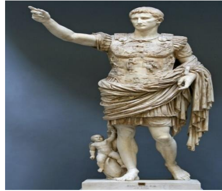
Figure.D An ancient Roman art work Portrait of Augustus as Mars Ultor.