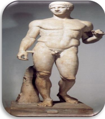
Figure.C An ancient Greek art work called “The Spear bearer”, by Polyclitus.